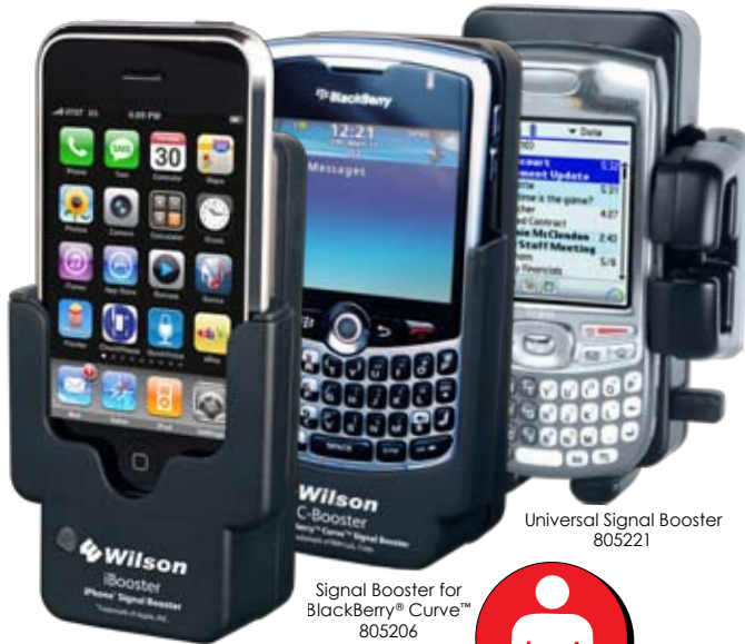
Signal Booster for iPhone® 805201