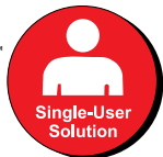
Universal Signal Booster 805221