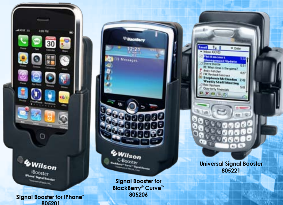
Signal Booster for iPhone® 805201

INCREASES POWER TO THE CELL SITE UP TO 20 TIMES OVER THE CELL PHONE ALONE